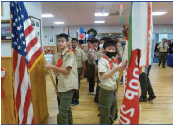
Troop 201 color guard present the colors at Albertson Firehouse