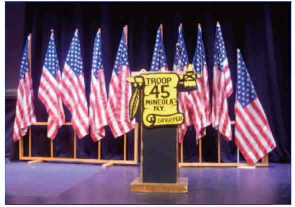
Troop 45 American Flag display at Eagle Ceremony