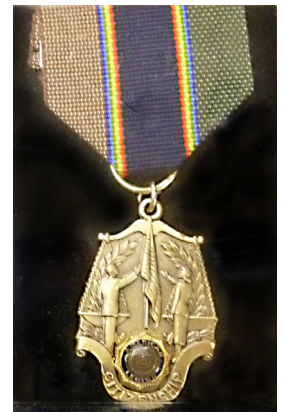
American Legion Citizenship Medal