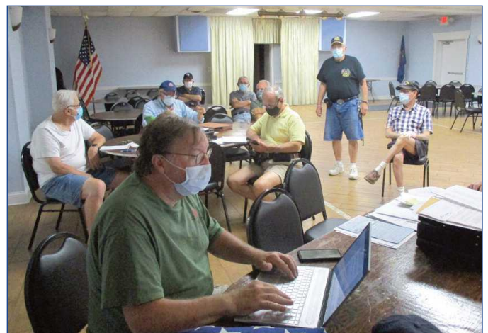
Legionnaires attend their first Executive Board Meeting. Like good troopers, they all observed the proper social distancing and use of protective masks.