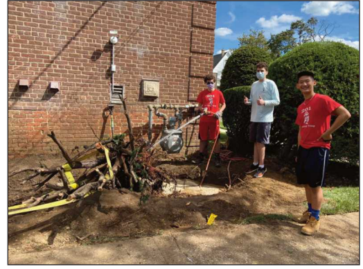
Thumbs up with the hardest part almost over.

As you can see, several giant shrubs were removed and a beautiful array of shrubs replaced them.