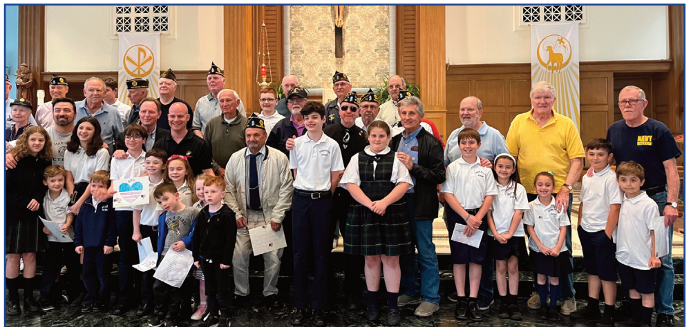
Thanks to St. Aidan's Parish School for the honors shown to veterans for Memorial Day. Their program was both enjoyable and inspiring.

I want to thank all the ALA members for their help each year. Without the help of ALA members Children and Youth program will not be a success. Thank you so much for your help.