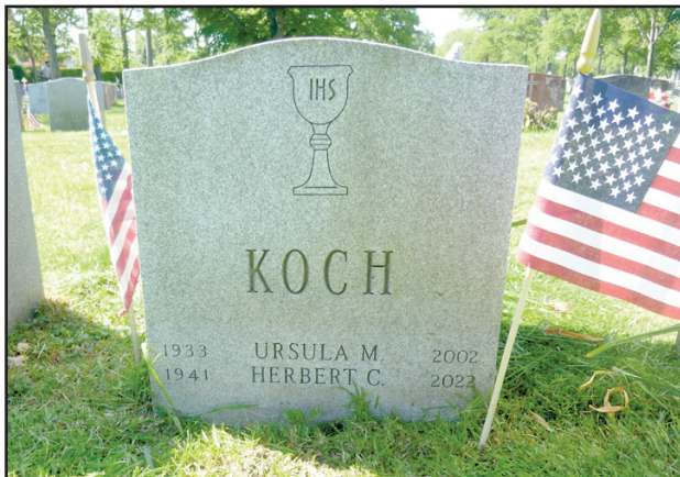
Memorial Day will always be a day that we honor our departed fellow Legionnaires. Thanks to all of the volunteers who helped fulfill this duty.