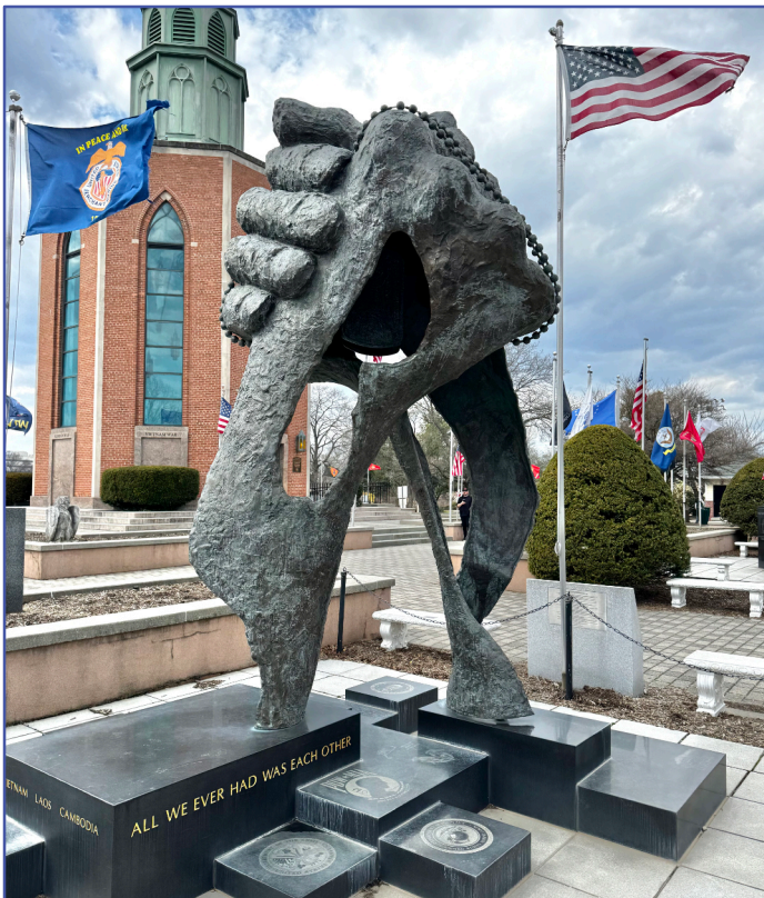
Eisenhower Park Memorial

Our April meeting will be on Thursday, April 17 th at 7:30pm. Come on down and join our meeting. We'll probably have some food and drink after the meeting, too. Let's see if we can build some active participation and restore some of the old vitality that we had before. I look forward to seeing you.