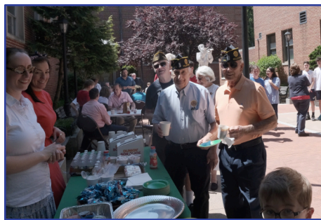
Just look for a chow line and you will find a Legionnaire. St. Aidan Memorial Day program