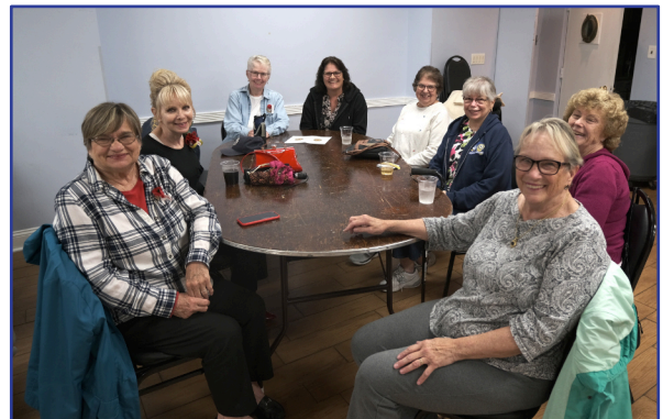
Unit members at the May Legion Meeting

GOD BLESS AMERICA, OUR VETERANS AND OUR SERVICE MEN AND WOMEN