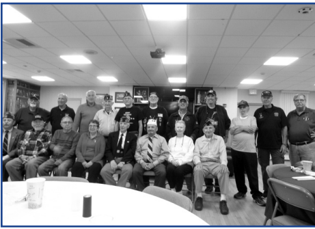
Thanks to the Albertson Fire Department for the generous luncheon provided to the local vets on Veterans Day