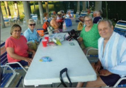
All smiles for the camera.