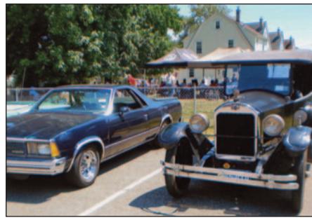
Post 144 hosts a car club (in rear of photo) picnic/show in our spacious yard. Fun for club members and anyone who stopped by to check it out.