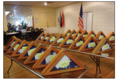
Post 144 has recently agreed to help a closing Whitestone VFW post in passing burial flags on to surviving relatives of their members.