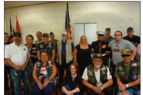
Legion Riders assisted in delivery of the VFW flags.