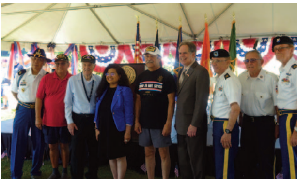
Local representatives join Legionnaires in honoring the Armed Forces.