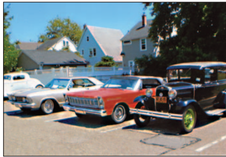
For those who love nostalgia.....even more cars