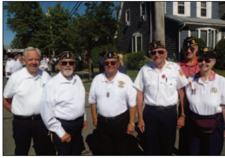
Tough guys (and gal).....long walks in the hot sun are the specialty of these marchers