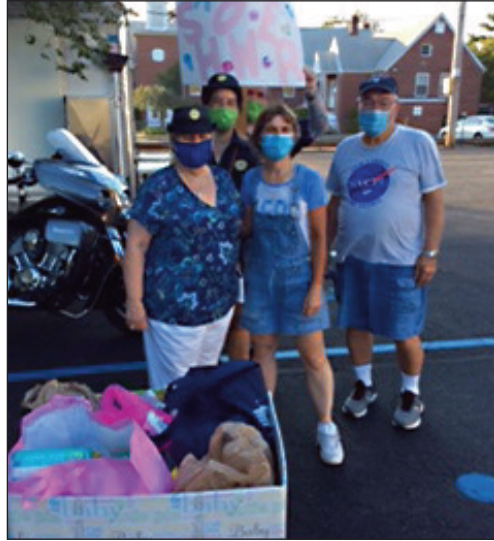
Just some of our hard-working volunteers.