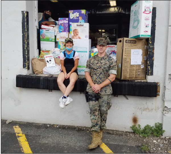
Nassau County Children and Youth Program is proud of our successful drive.